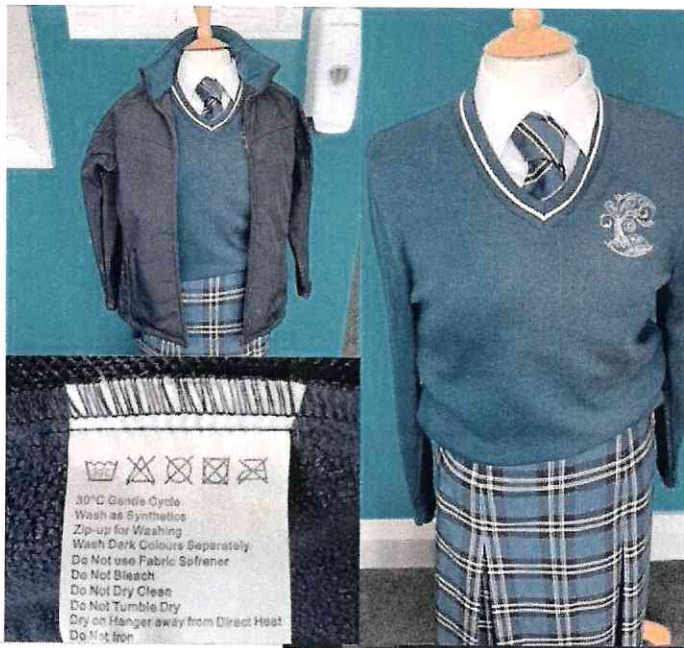
Jumper, Tie and Jacket