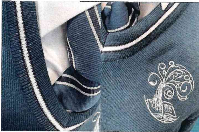
Jumper, Tie & Crest