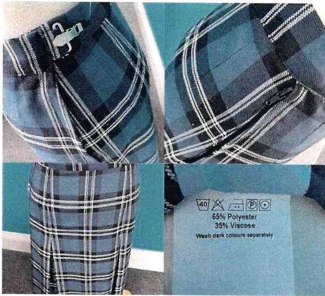
Enfield Community College Skirt